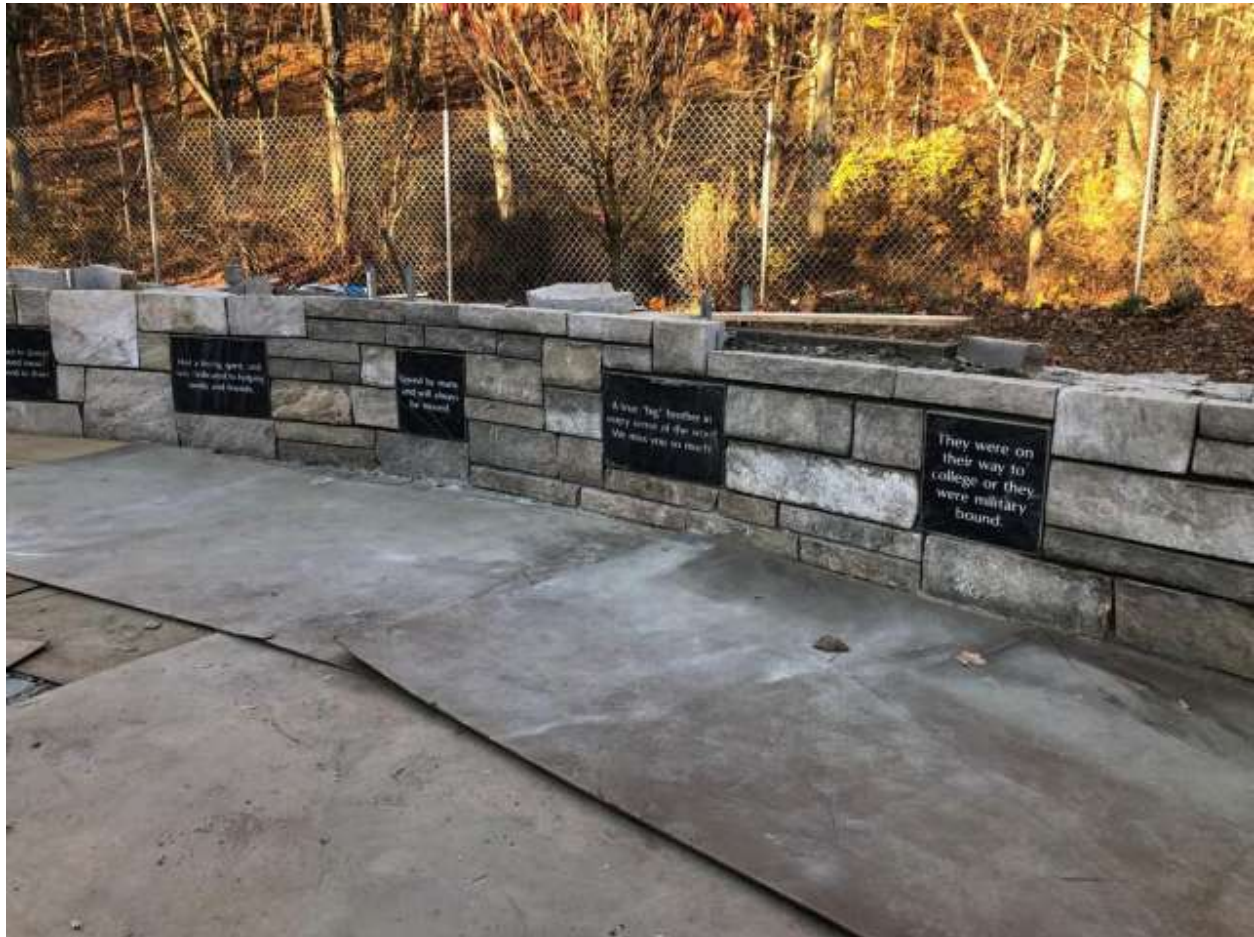
The New Haven Botanical Garden of Healing Dedicated to Victims of Gun Violence.