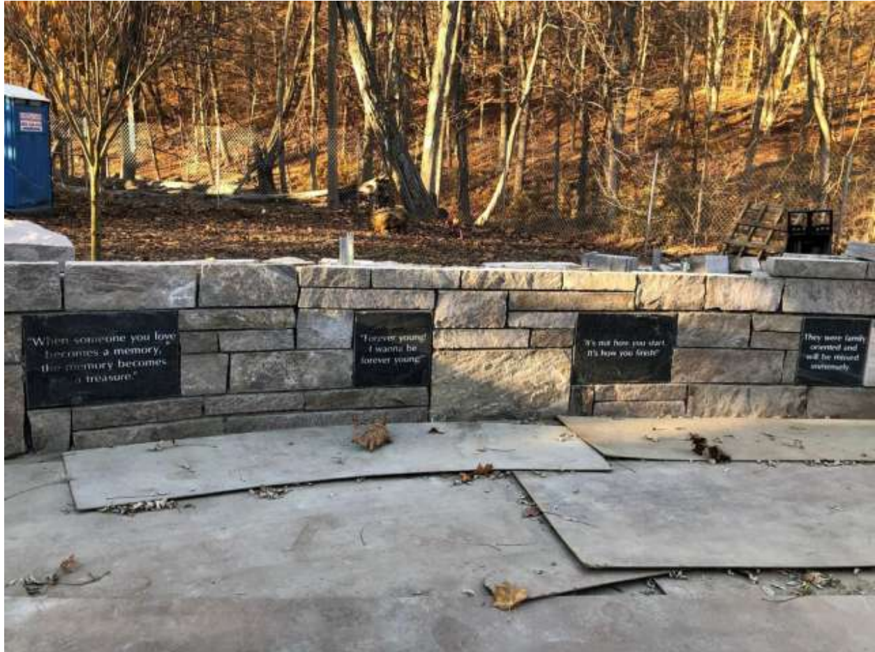
The New Haven Botanical Garden of Healing Dedicated to Victims of Gun Violence.